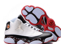
Air Jordan 2010 Silver shoes Jordan 19 AJ19 ID:5121 Free Shipping